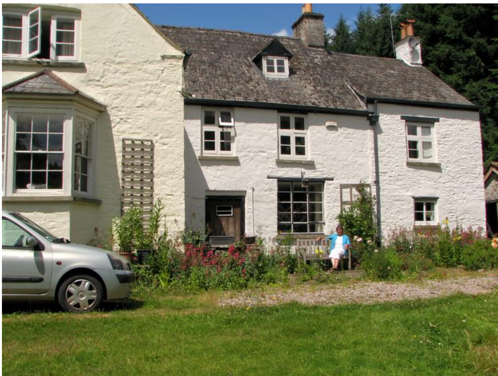
The new owners of the lodge have maintained the external appearance whilst replacing windows with minimum alteration.