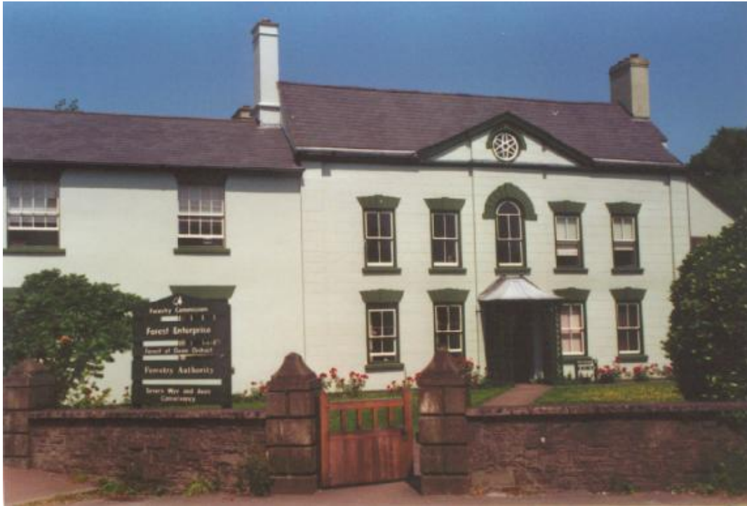
Bank House, Coleford - Built in 1786. Home to Forest Enterprise and Deputy Gaveller. Coleford Parish