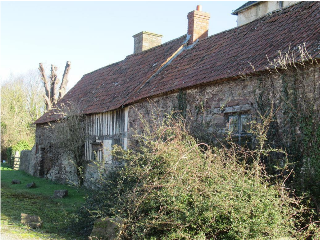
Little change since 2010, although vegetation is growing, including ivy climbing the walls of the structure.