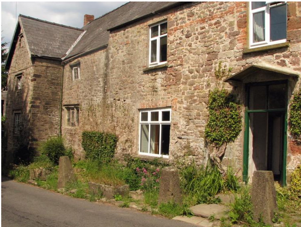
Little change can be seen apart from the removal of foliage.

View direction - North West Date taken - June 2000