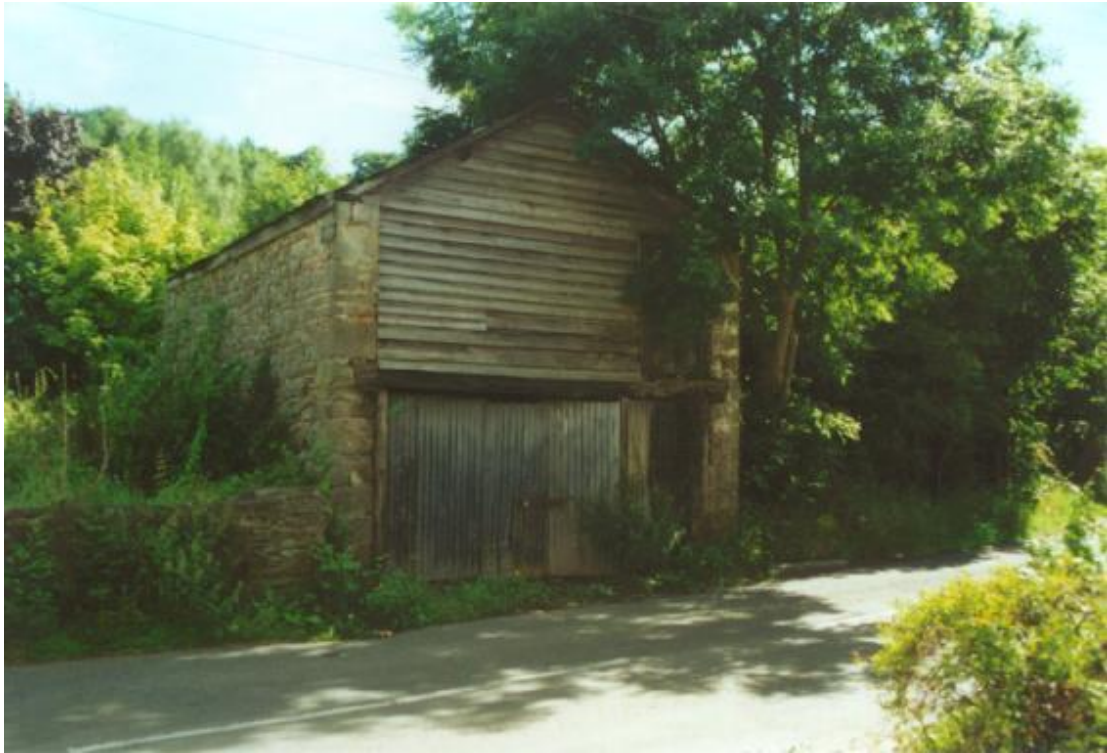
Horlick's Barn, Ruardean - The building where the Horlicks brothers are reputed to have carried out early experiments leading to successful drying of milk.