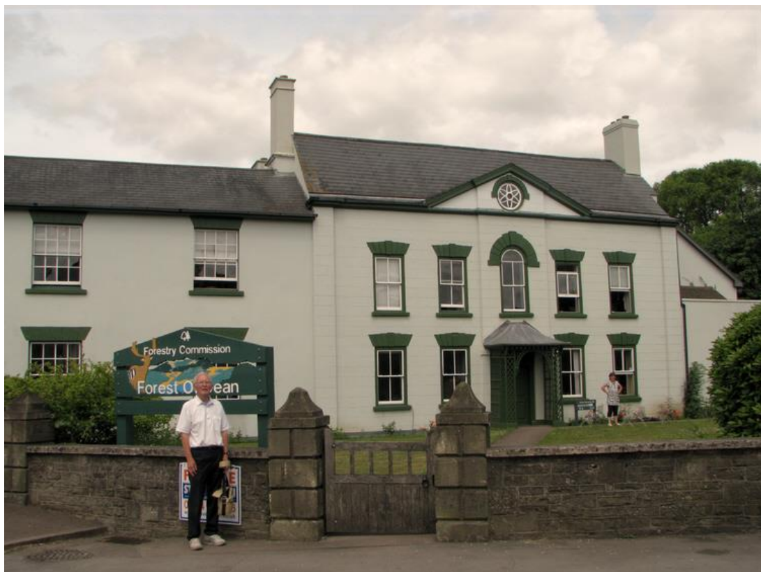
Little change apart from a new notice board and the need of the front gate for some treatment.