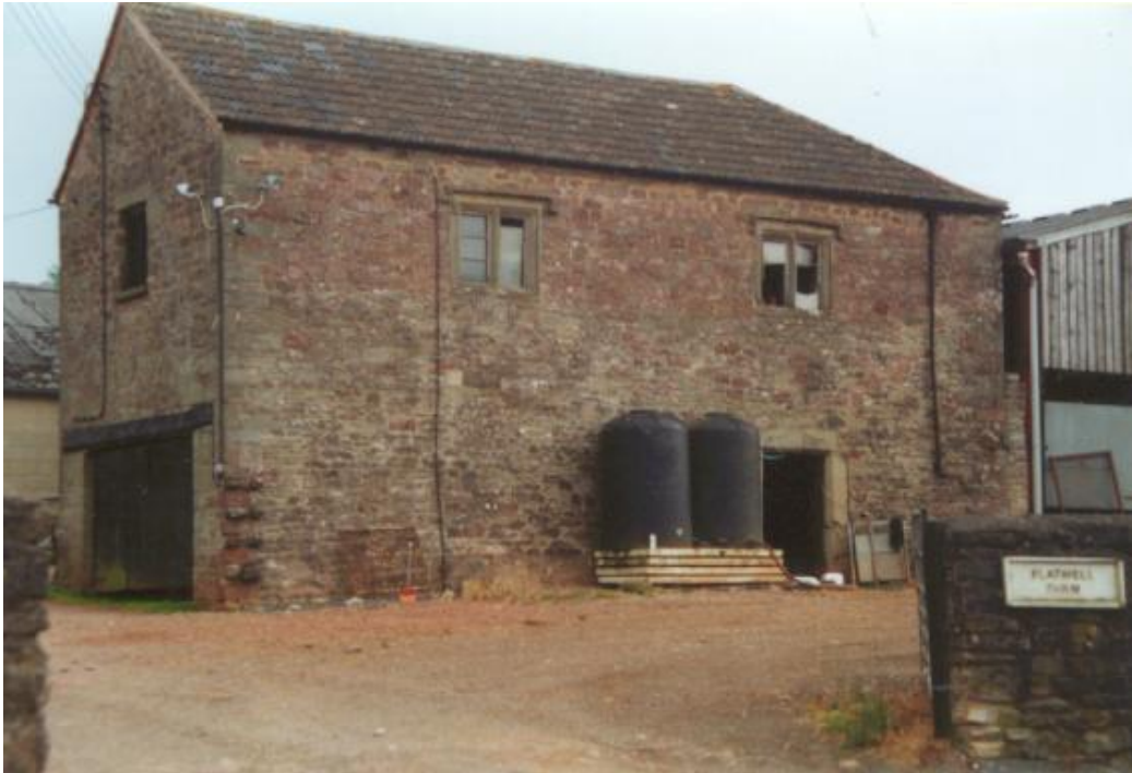
Platwell Farm 'carhouse', Clearwell - Originally a farmhouse that was replaced by a Georgian farmhouse, dates from seventeenth century.