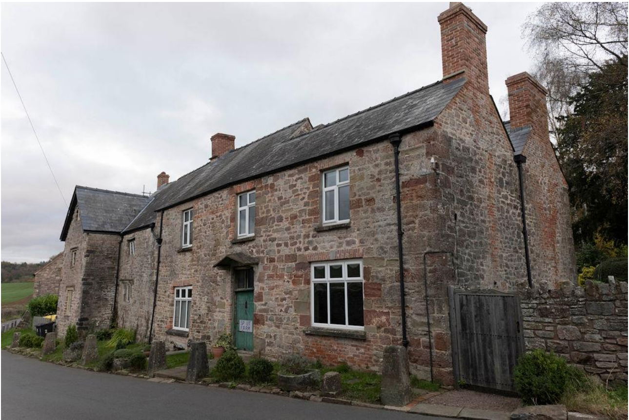
The farmhouse continues to be well maintained in 2021.