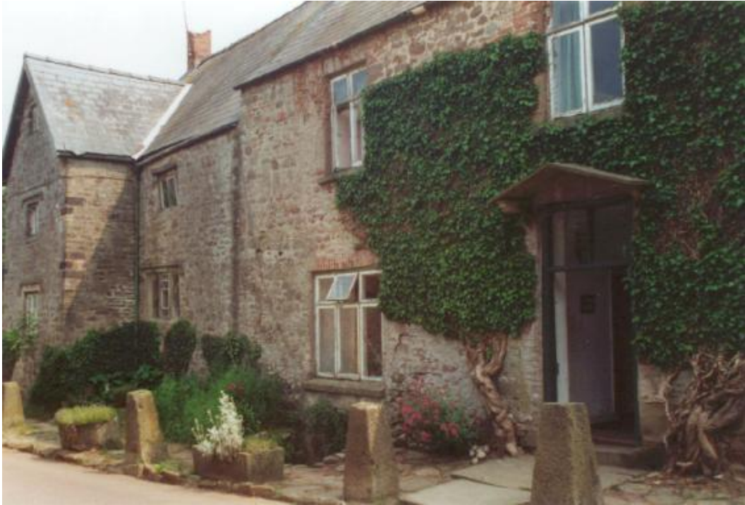
Spout Farm, Newland - Oldest part is the central part, dates from c1500. Newland Parish

Camera location - SO553097