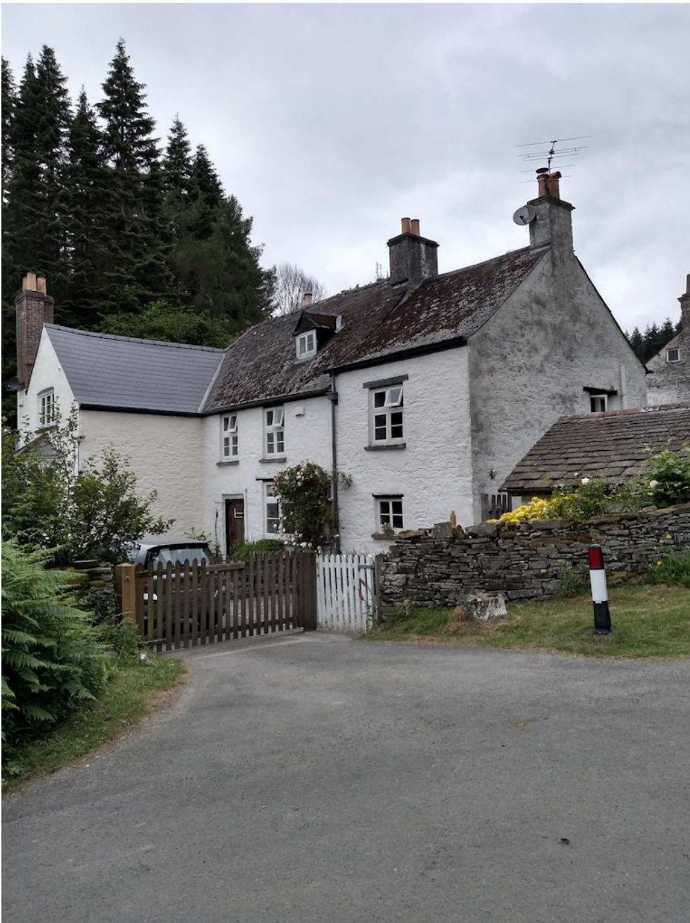
Few changes since 2010.