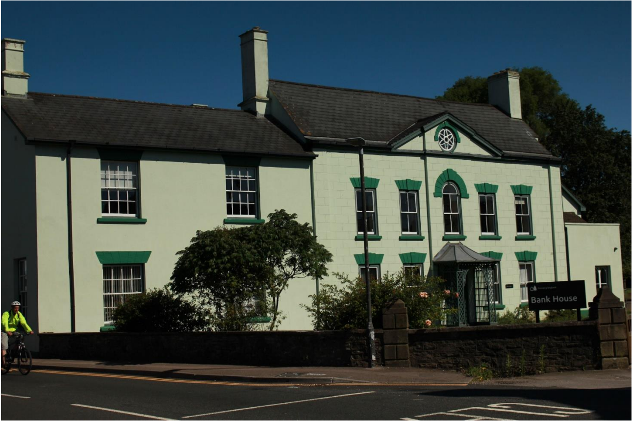
A new notice board is the only obvious change in 2021