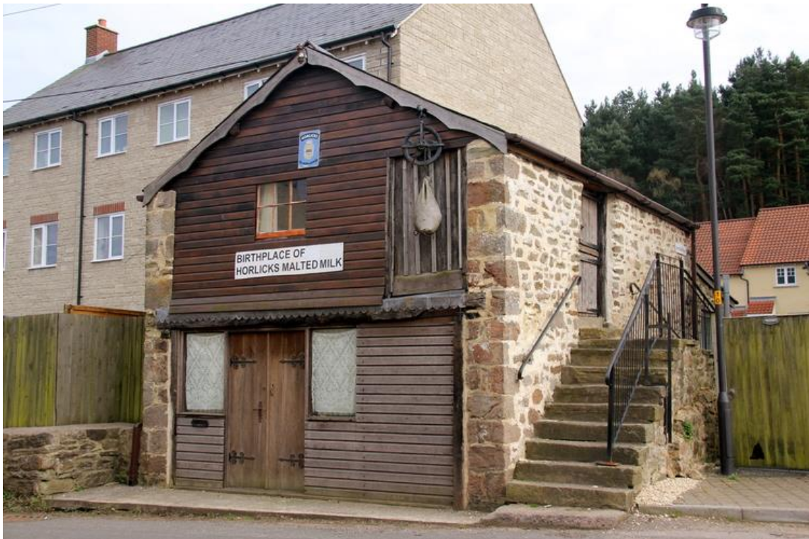
The renovated barn in 2010.