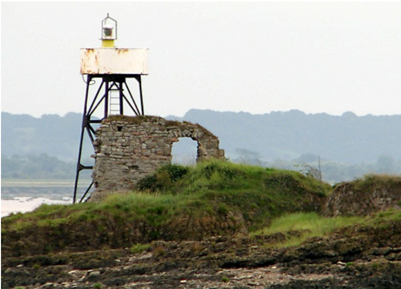
St Tecla's Chapel, Beachley.