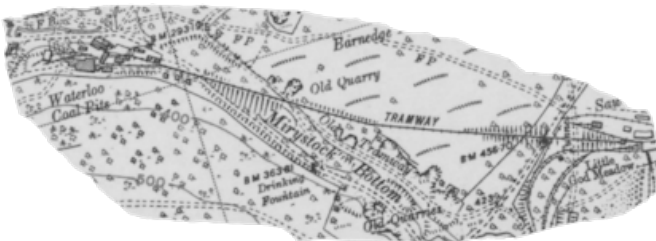
1940's OS map Hereford LIV, showing the Waterloo Creeper (marked 'Tramway') between Waterloo and Miery Stock Screens.